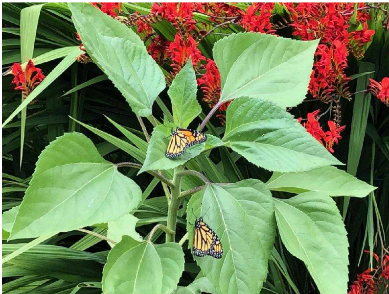
Monarch butterflies chilling on a local resident sunflower

It's so exciting when people see positive results. A Cottage Grove resident recently sent us photos of Monarch butterflies in their garden.