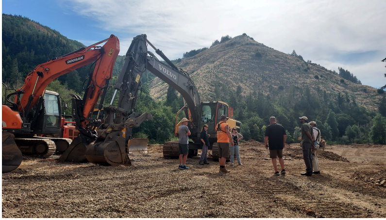
CFWWC's Board of Directors tours the site.

We're very excited to see the evolution of this project site. Thousands of trees, shrubs, and riparian plants are slated to go in to the ground this fall and we look forward to reporting progress as this restoration continues.