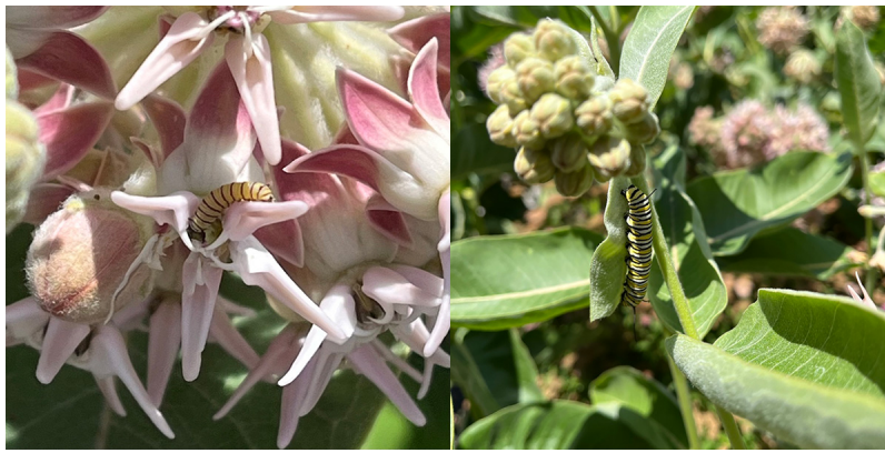
Monarch Larvae (left) and caterpillar (right) on showy milkweed.