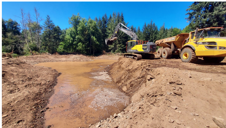
The first pond being excavated, already filling with groundwater.

Like so many of our waterways, Mosby Creek has been subject to channel straightening and industrial timber activity for many decades. The site now resides on BLM land.