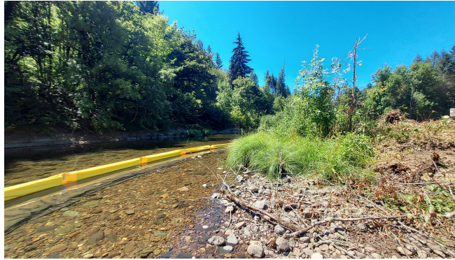
Silt curtains installed in Mosby Creek at the work site.

Officially named "Increasing Complexity in Mosby Creek's Floodplain Habitat for Northwestern Pond Turtles Project", this endeavor has been years in the making and is finally being put into action.